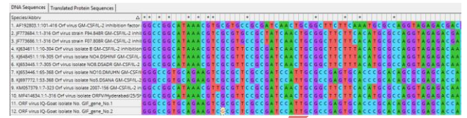
Figure 3: Multiple sequence arrangement analysis of GIF gene in local ORFV IQ-Goat isolate and NCBI-Genbank in local ORFV IQ-Goat isolate. The multiple alignment analysis was created using ClustalW alignment implement in MEGA 6.0 version. That show the nucleotide alignment likeness as (*) with substitution mutations in GIF gene.

99.34% identity at the nucleotide level with the other strain of Iraqi sheep ORFV KJ653446.1 as in table 2.