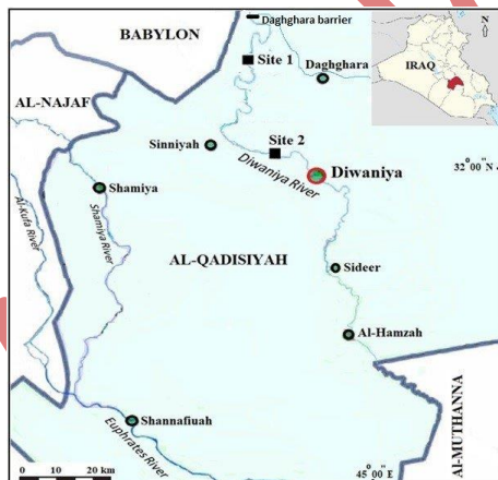
Figure 1: Study location, Al-Dagharah district in Al-Qadisiyah province, Iraq (google maps).

The study was planned to be done from December, 2018 to January, 2019 in the rural part of Al-Dagharah district positioned in the north east of Al-Qadisiyah province approximately on latitude 31.58°N, longitude 44.500°E. in the middle of Iraq (Figure 1).