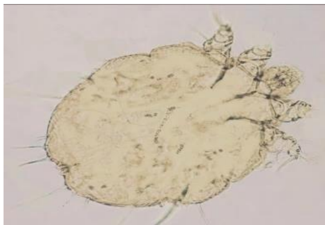
Figure 2: Sarcoptes scabiei parasite in the examined skin scrapings, 40X.