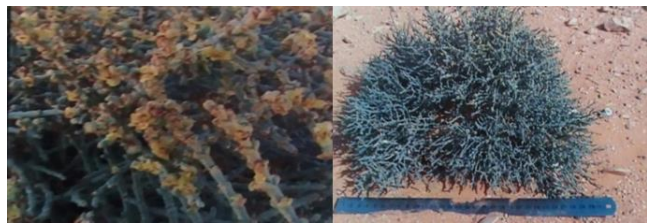
Figure 1: The Nitol plant Hammada articulata .