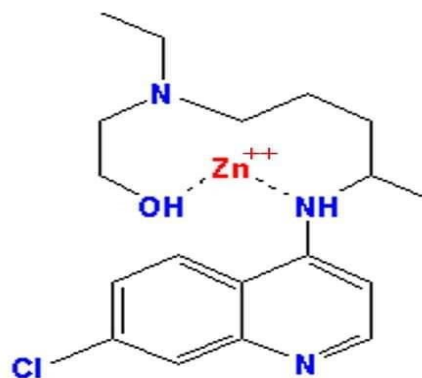
Figure 3: The proposed chemical structure of HCQ- Zn^{+2} complex (16).

the amino and O atom of the hydroxyl groups, this HCQ- Zn^{+2} complex known 1:1 complex as shown in (Figure 3). This complex has shown an antioxidant activity and has also exerted an essential role against the viral invasion and replication (16-18). Moreover, the activity of Zn against COVID-19 is considered to be due to its ability to inhibit the RNA-Dependent RNA Polymerase, an enzyme responsible for the formation of viral RNA, and therefore, it reduces the viral replication and minimizes the virulence of COVID-19 (19-21).