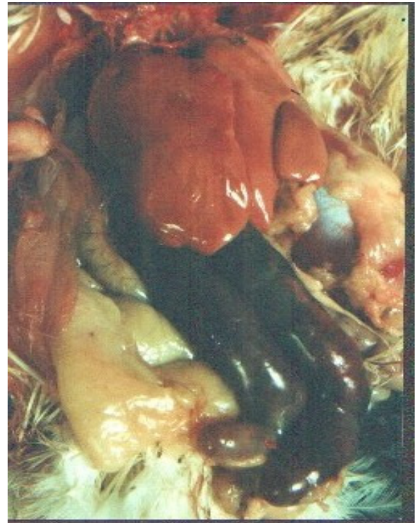
Figure 1: Necropsy liver and caecal lesions of broiler 35 days of age, showing creasy, yellow-ochre discolored liver, with ballooned two caeci, filled with free blood.

N0.1 was about, they were 28 and 16% respectively. Two percent of score 2 was recorded in both broiler flocks. Relatively similar percentage for both broiler flocks 1 and 2, and they were 10 and 8% respectively. No score lesion of (0) was reported in flock No. 1, while the score was higher ten times in flock No.2.